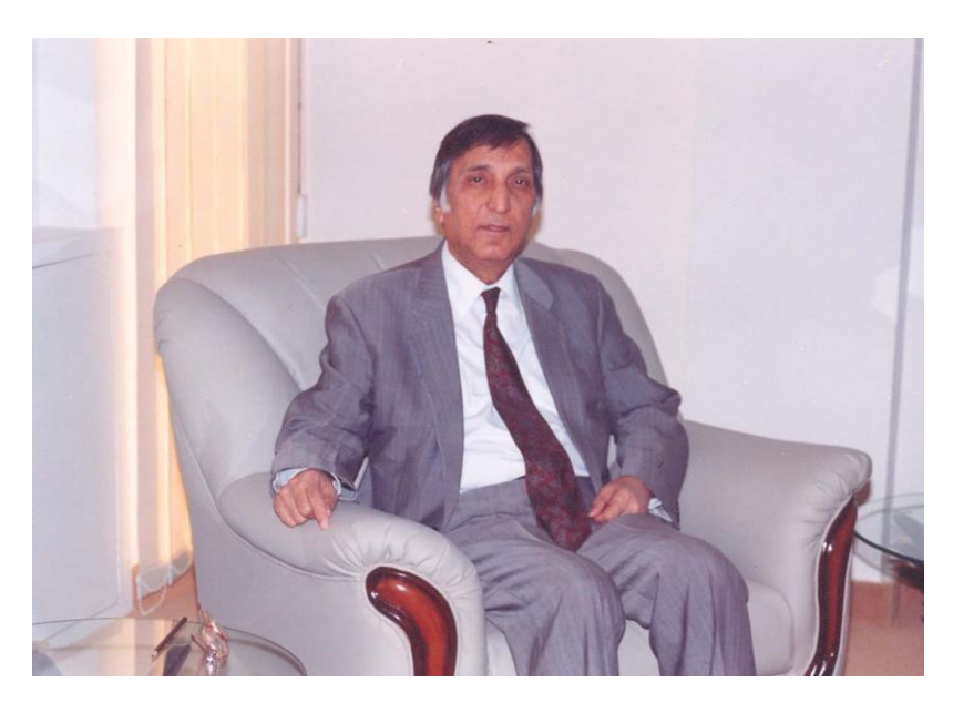
Late Dr. S. M. Qureshi

Pakistan like many other developing countries needs to develop its education system to achieve multiple goals of training people in emerging fields and at different levels, both quantitatively as well as qualitatively to run a contemporary modern society and meet the requirements of the new century concerning the economic development, national security as well as the value system.